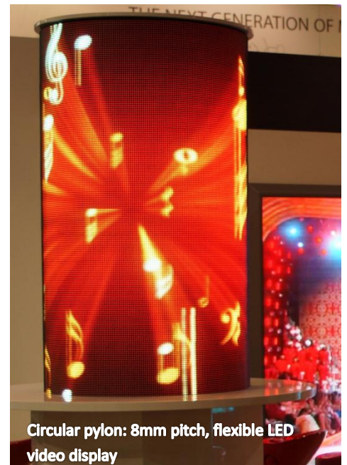
Circular pylon: 8mm pitch, flexible LED video display

the structure rather than simply being attached," says Richard. "LED signage technology has definitely come a long way from the days when it was used as simple variable message boards and LED-Signs are committed to developing an innovative and flexible architectural product range that has both artistic and communication value," adds Richard.