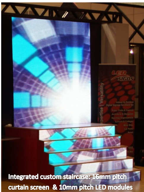
Integrated custom staircase: 16mm pitch curtain screen & 10mm pitch LED modules